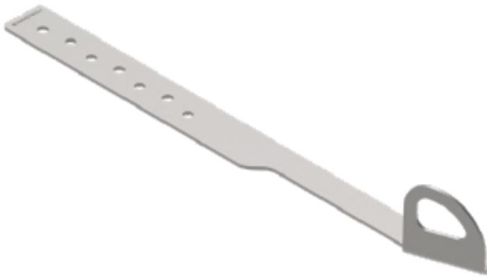
Fig. 1: Anchor device, type: SDA-35

The anchor device is fastened to the ground using appropriate fastening elements in the holes (Ø 8.5 mm) of the base plate. The user can connect his personal protective equipment against falls from a height to the eyelet. The anchor device can be loaded in all directions parallel to the building structure.